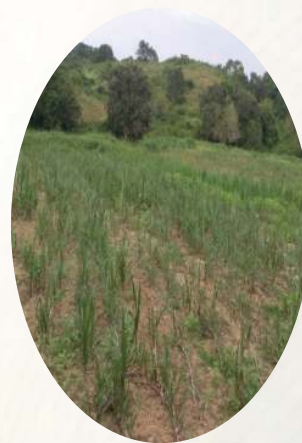
Development Of Pasture At Karabungan Farm