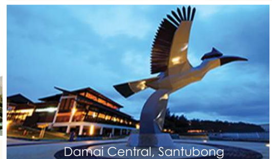
Damai Central, Santubong