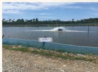
Mudcrab transfer to grow-out ponds