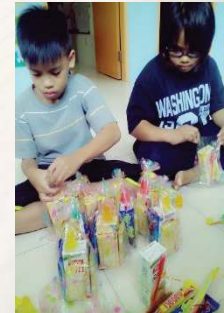
Before & After School Care children in SeDidik Perdana Sibu Waterboard

SeDidik provides special programmes that enhance the children's learning abilities. These programmes include;