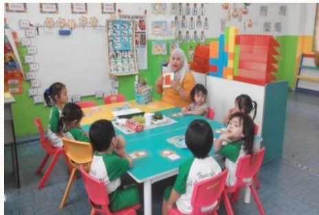
Early Mathematics activity in SeDidik Mutiara RPR Sebiew, Bintulu