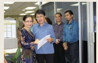
Staff Collection for bereavement