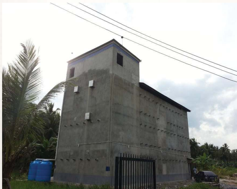
Proposed Swiftlet Eco Park Project, Jemoreng & Daro District