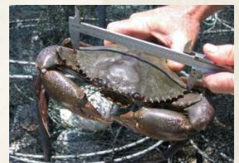
Harvesting and Grading