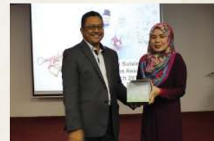
Wedding Gift to staff