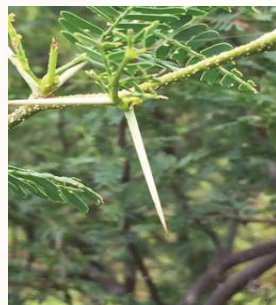
Hazardous Mimosa Weed Control Programme