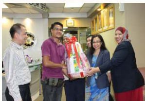
Gift for New Born