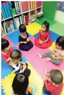
Play upon arrival – Taska SeDidik Perdana Pending