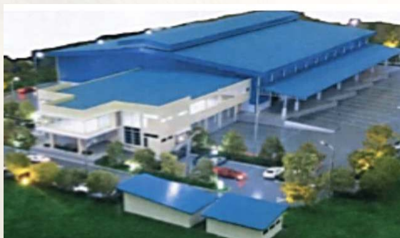
Proposed Warehouse Project, Sejingkat