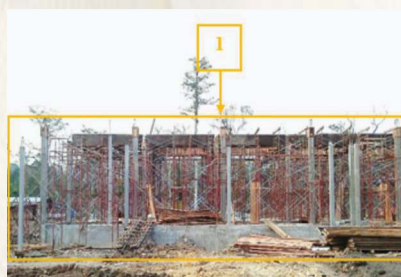
Installation of Beam Formwork for Halal Abattoir Building in Progress