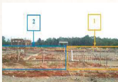
Holding Yard 1. Backfilling and Soil Compaction at 1st Section Completed 2. 2nd Section of Ground Beam Completed