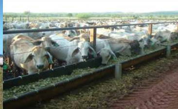
Cattle Holding Yard