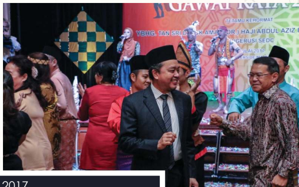
20 July 2017, Sarawak Chamber, Riverside Majestic Hotel, Kuching