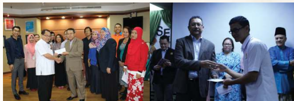
Festive Collection for Junior Staff