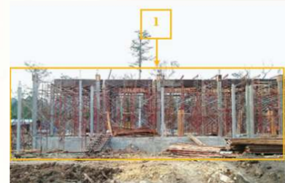
Installation of Beam Formwork for Halal Abattoir Building in Progress